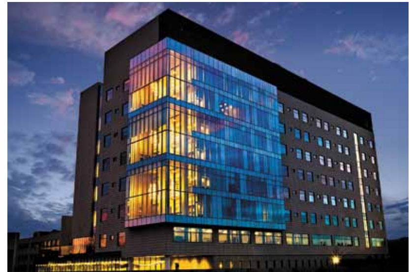
Randall Children's Hospital